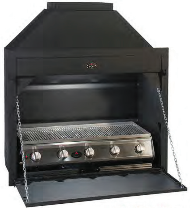
SUPER DE LUXE - 1000

The Home Fires Super de Luxe Built-in Gas Braai are standard fitted with a light fitting for trouble free evening grilling. Two models are available, namely a model 800mm which includes a 4 burner flat top Stainless Steel Gas Grill and a model 1000mm which includes a 5 burner flat top Stainless Steel Gas Grill.