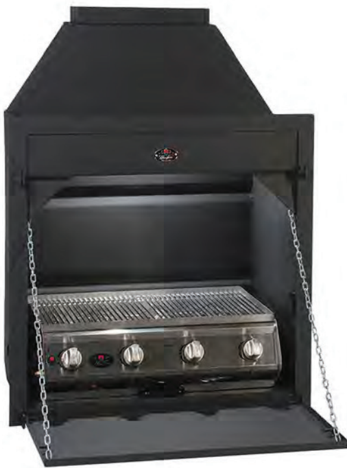
SUPER DE LUXE - 800

Standard items of equipment are a 5 burner flat top Stainless Steel Gas Griller (9905), a top and bottom door, insulation, touch-up paint and a light fitting.